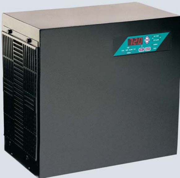
Unit shown above is custom-painted 'Jet Black'. Standard units are painted ANSI 61 gray or brushed stainless steel. Other custom colors, such as beige, are also available.

UL / ULc Listed, NEMA 12 / IP54 Steel units: NEMA 4 w/N4GK kit SS units: NEMA 4X w/N4GK kit